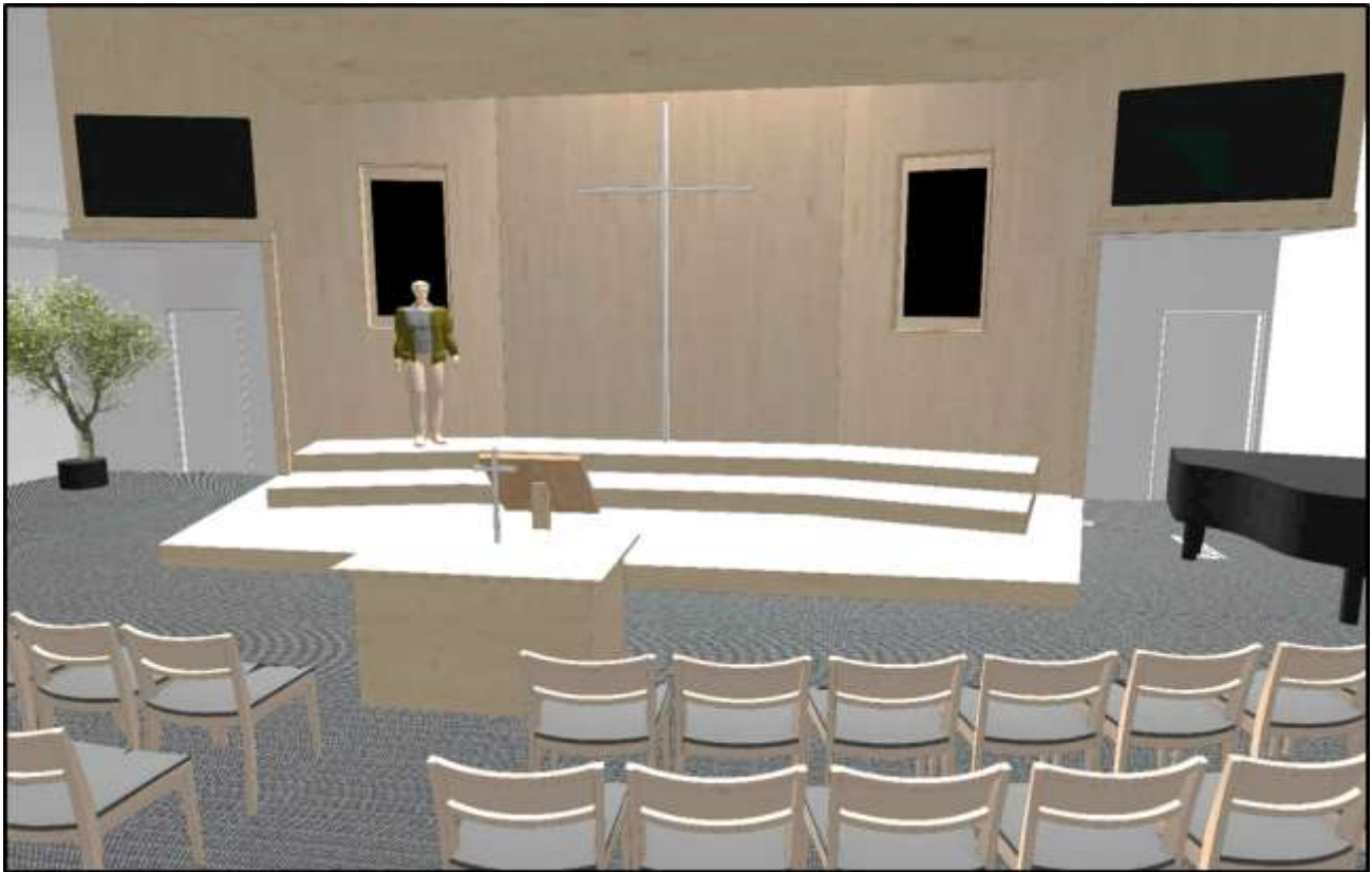
Example View of the New Multipurpose Sanctuary (looking South)

We are recommending this work coordinated by the building committee, but we will need a Sanctuary Design committee for a short-term review of design options (colours, stage, finishes, sound, lighting, audio visual, worship, music). We hope to complete the work from mid June to mid Sept. 2020, if we can move forward quickly and funding is in place. We are considering advisability of doing new flooring in the Narthex at the same time as the Sanctuary.